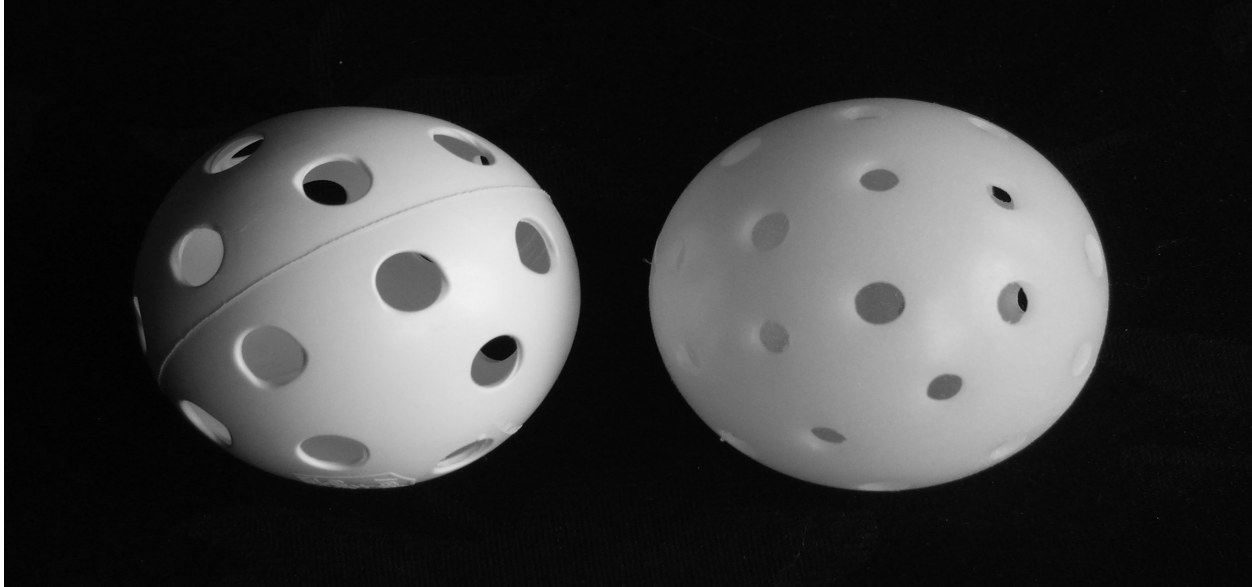
Figure 2-2. The Ball.

The ball pictured on the left of Figure 2-2 is customarily used for indoor play and the ball pictured on the right is customarily used for outdoor play. However, either ball is acceptable for indoor or outdoor play.